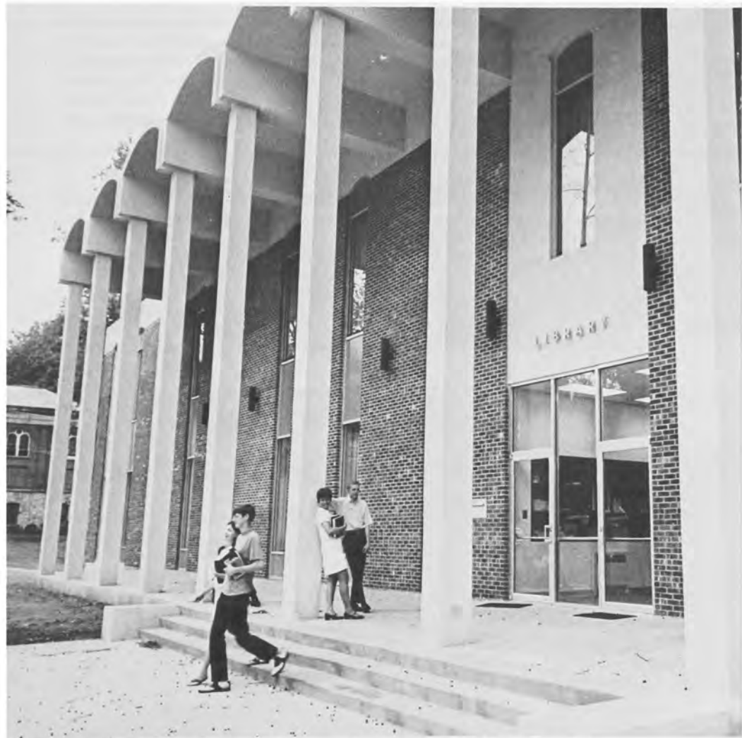
Oxford College's new library houses some 23,000 volumes.

Future Teachers. Loans from the National Defense Education Act are available for students planning to enter the teaching profession. One-half the total amount of the loan is cancelled when students become teachers and have completed the time required for this consideration. For students from Georgia, there is a State Teachers Scholarship.