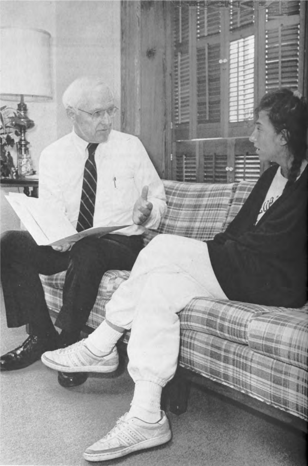
As the two-year undergraduate division of Emory University, Oxford College provides a solid liberal arts education within the parameters of a major university.